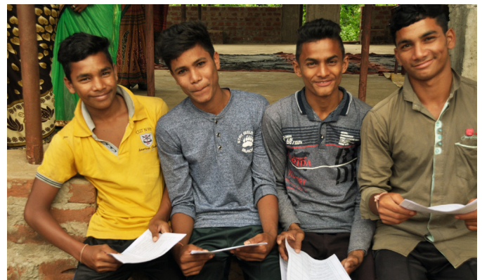
Members of the adolescent boys group of Dongabahal village in Odisha's Kandhamal district.