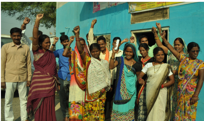
Members of different women groups after a meeting in Dhurukut, in Janjgir Champa district in Chhattisgarh.